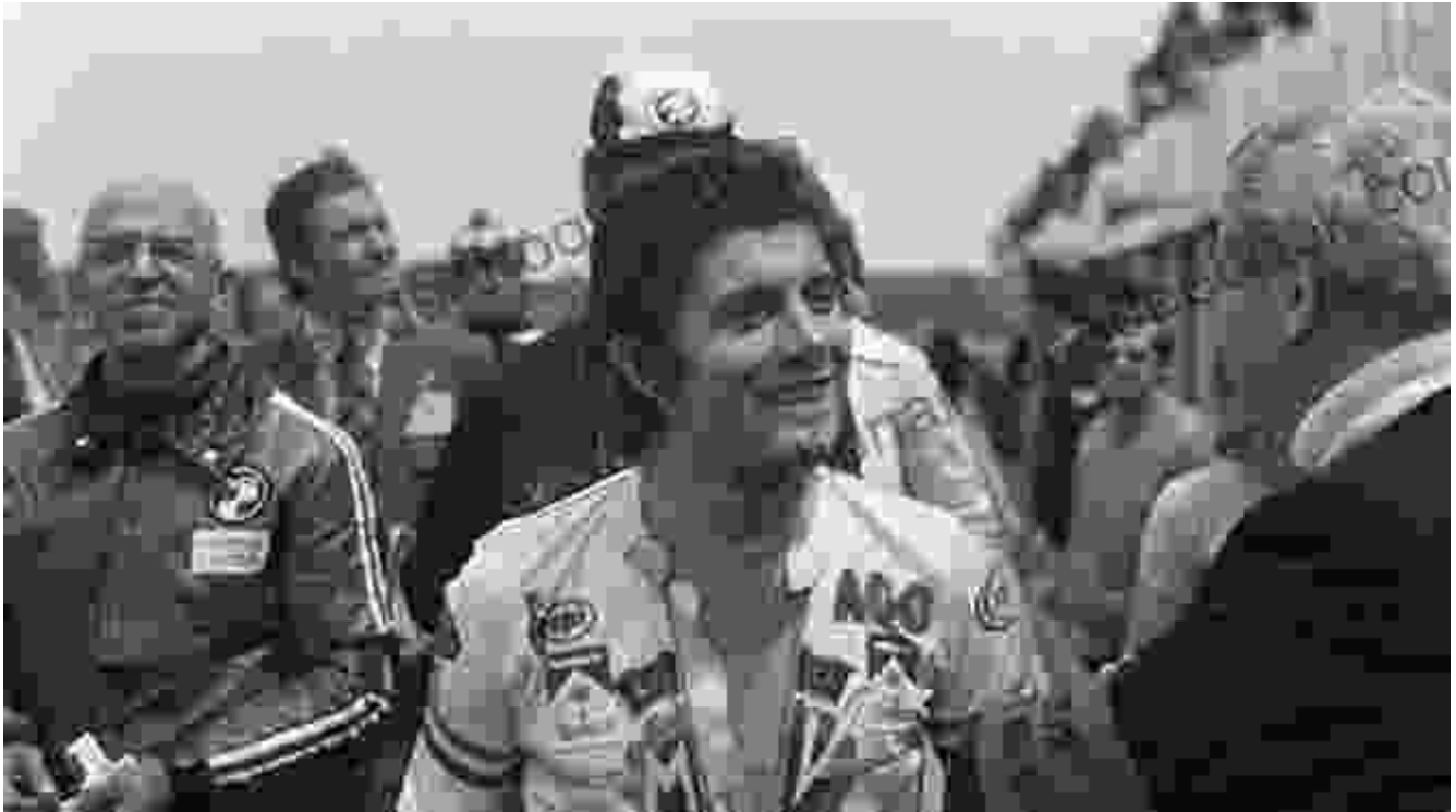
Giacomo Agostini winning his 10th TT race in 1968

Giacomo Agostini is another legendary TT rider. He won the Senior TT race a record 10 times, including five consecutive victories from 1966 to 1970. Agostini's victory in 1968 was particularly special, as it was his 10th TT win. He is the only rider to have won the TT 10 times, and his record is unlikely to ever be broken.