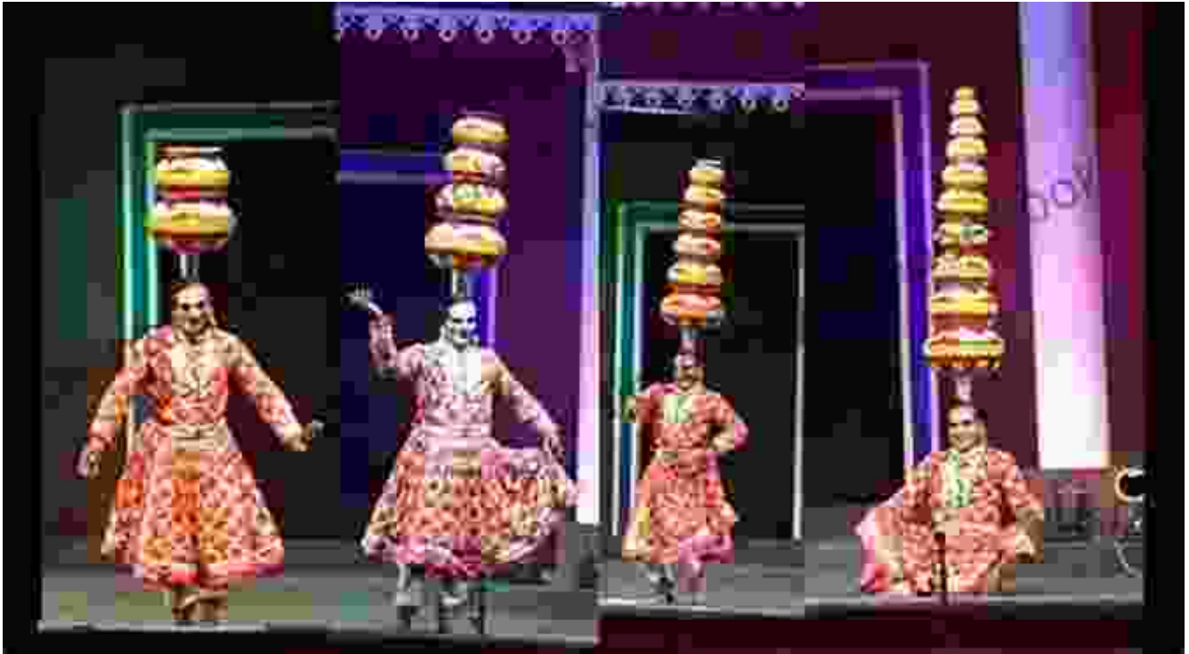
A colorful and energetic Bhavai performance